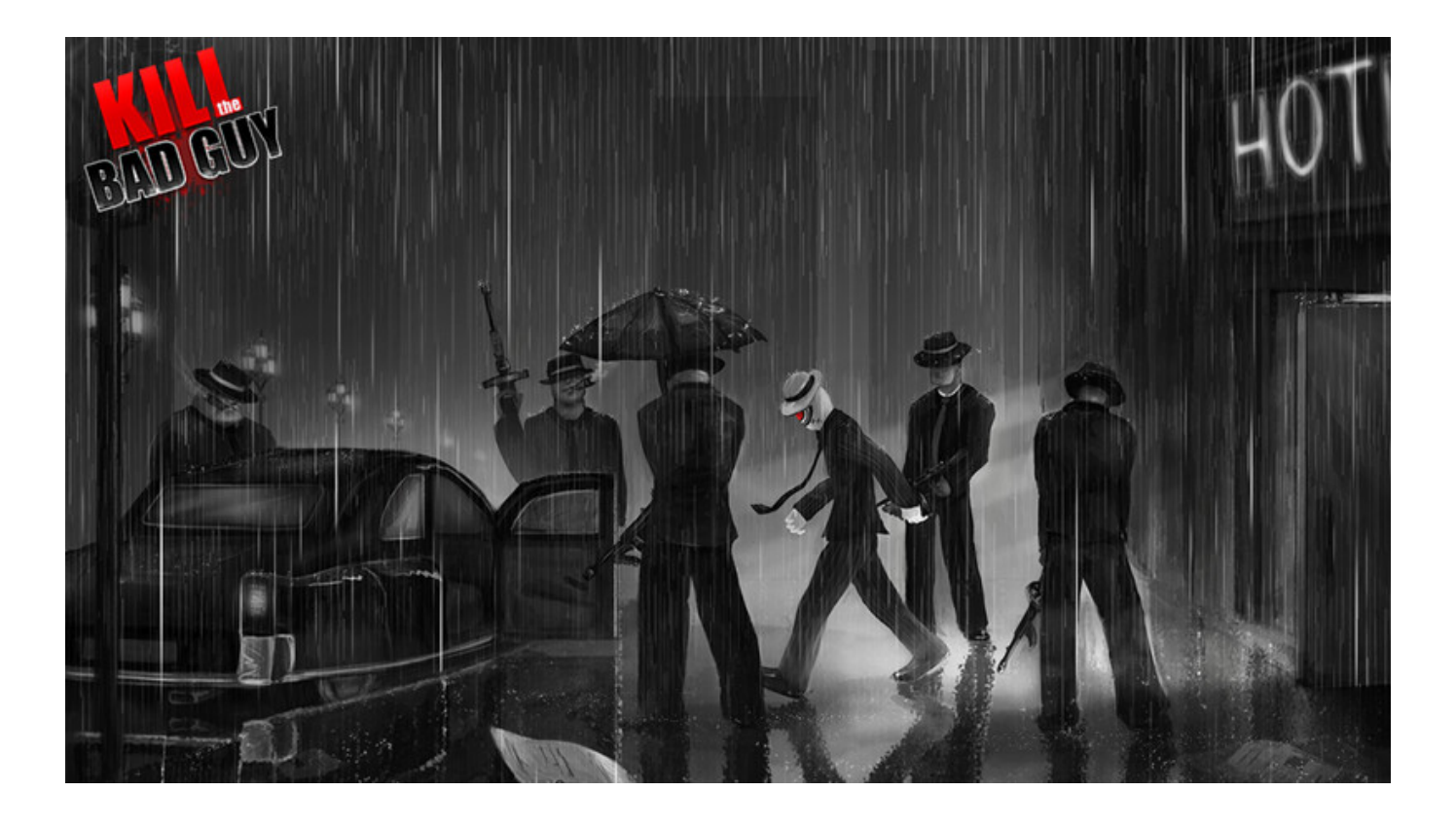
Download ->->-> <a href="http://bit.ly/2SKAjEx">http://bit.ly/2SKAjEx</a>